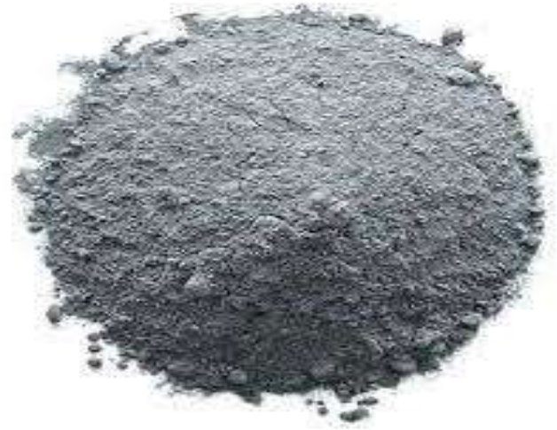
Figure 1: Fly Ash

enhances long-term strength and durability.