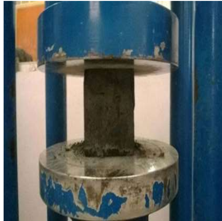
Figure 7: Compression testing machine