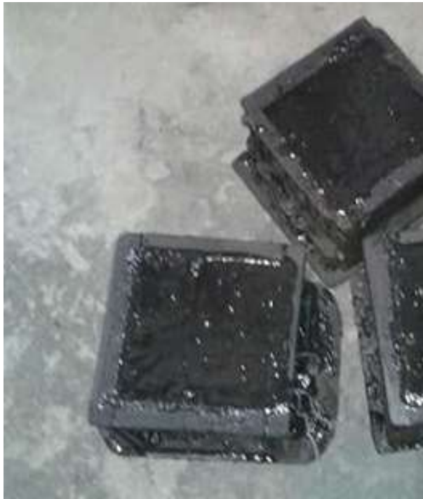
Figure 6: Casting and Curing