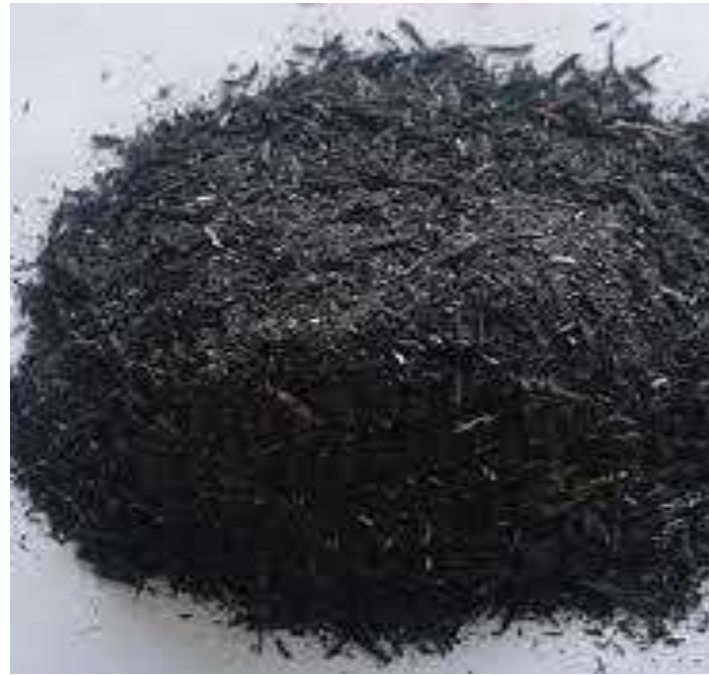
Figure 4: Rice Husk Ash