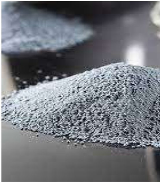
Figure 3: Silica Fume