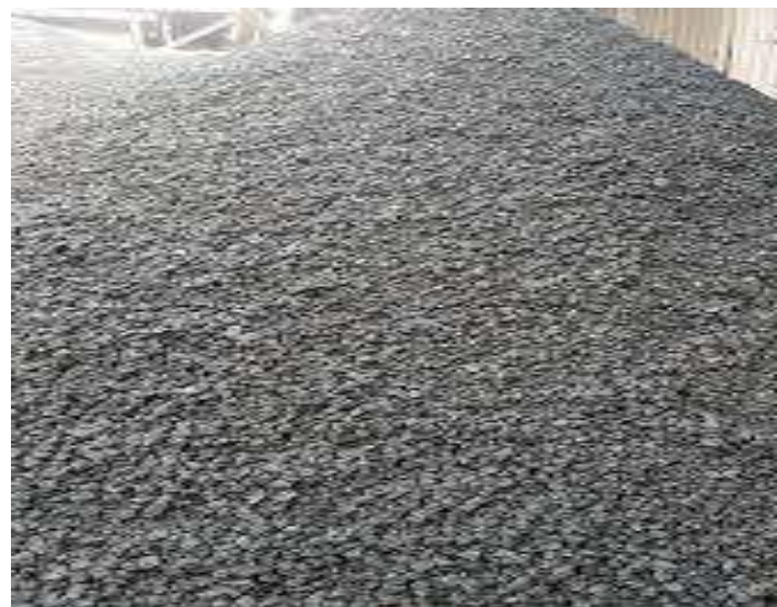
Figure 2: Slag