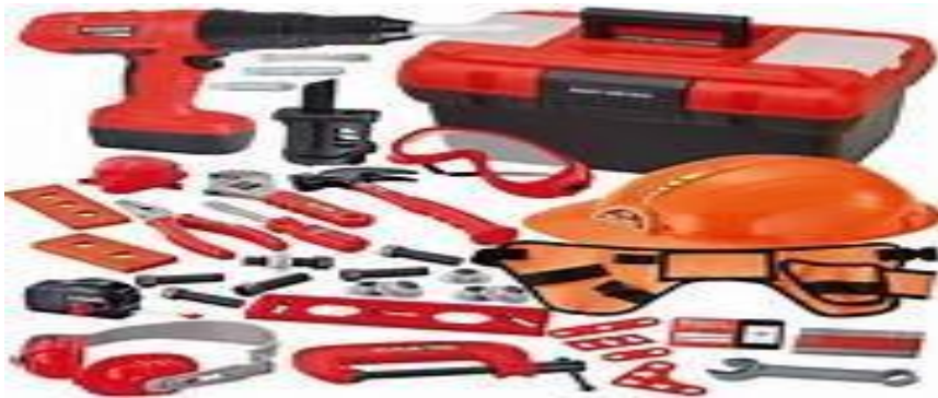
Figure.4 Working kit