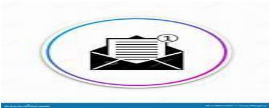
Figure.5 Received Message

By sending a simple SMS, you can recharge the electricity balance through this system. It can also disconnect the home power supply connection if there is a low or zero balance in the system. And this system will